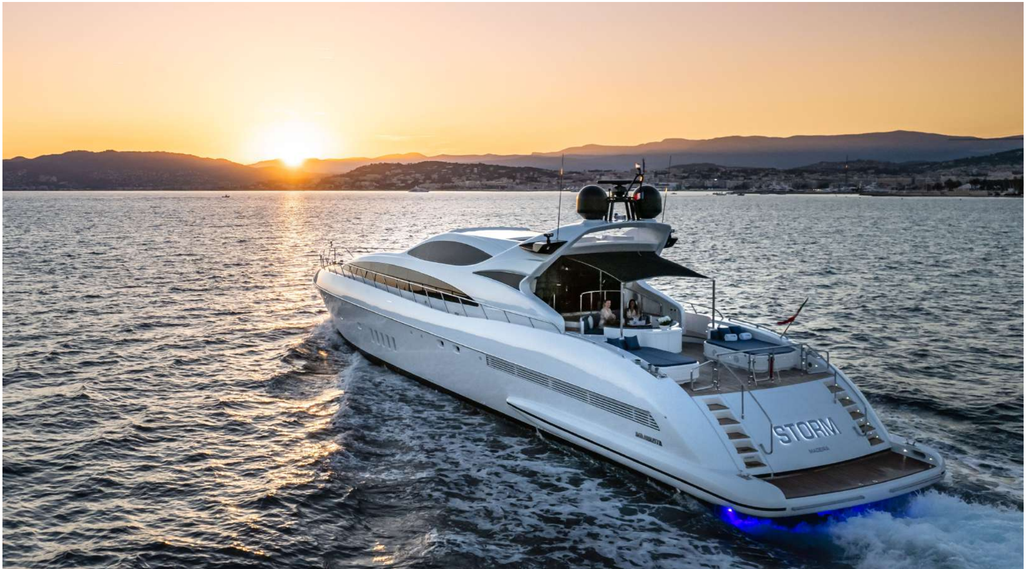
STORM - MANGUSTA 105 S